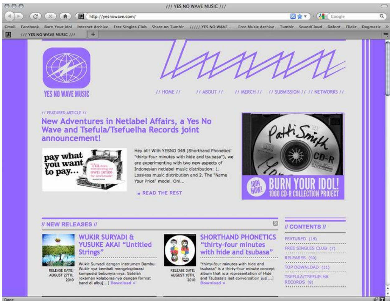
A screenshot of Yes No Wave